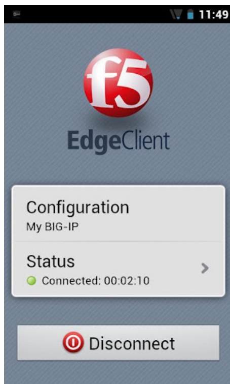
Figure 2: BIG-IP Edge Client on Android

BIG-IP Edge Client and Edge Portal work in tandem with BIG-IP Edge Gateway and FirePass® to drive managed access to corporate resources and applications, and to centralize application access control for mobile users. Enabling access to corporate resources is key to user productivity, which is central to F5's dynamic services model that delivers on-demand IT.