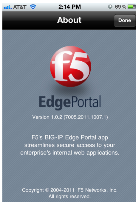
Figure 1: BIG-IP Edge Portal on Apple iPhone

The BIG-IP Edge Portal app allows users to access internal web applications securely and offers the following features: