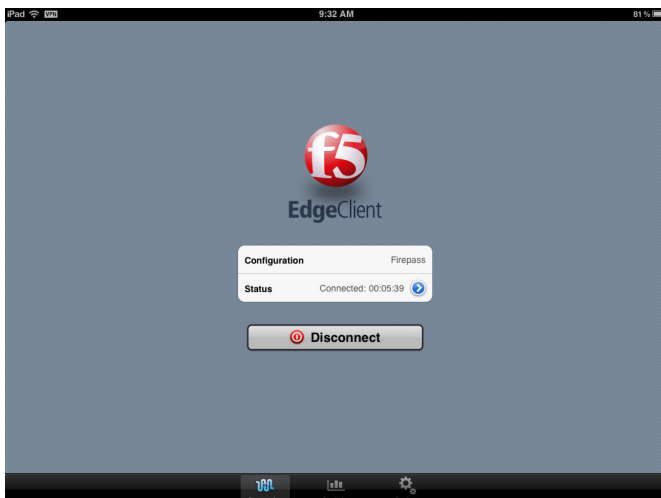
Figure 4: BIG-IP Edge Client on Apple iPad

BIG-IP Edge Client offers additional features such as Smart Reconnect, which enhances mobility when there are network outages, when users roam from one network to another (like going from a mobile to WiFi connection), or when a device comes out of hibernate/standby mode. Split tunneling mode is also supported, which allows users to access the Internet and internal resources simultaneously.